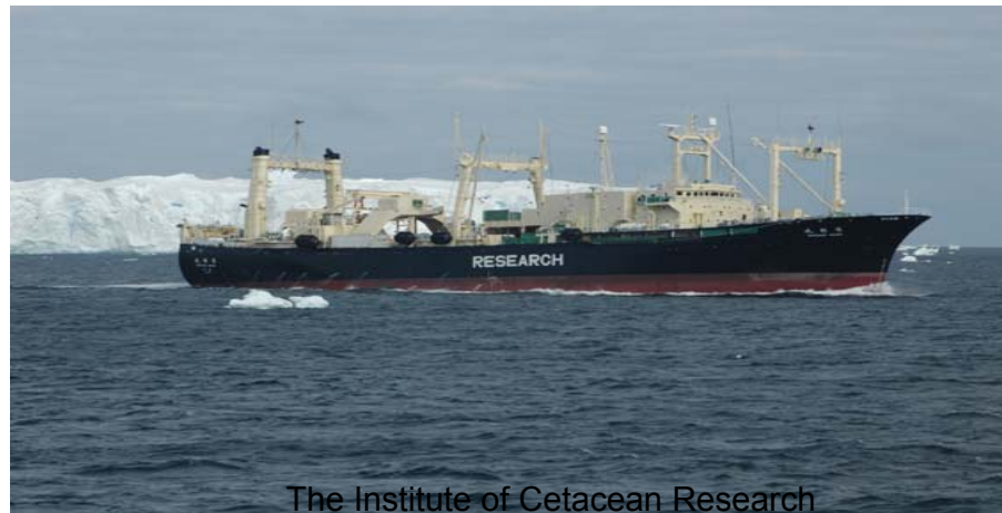
The Institute of Cetacean Research Research base vessel, Nisshin Maru